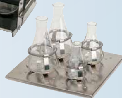
S2031-18 (clamps sold separately)